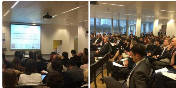
View more photos and videos

Maroš Šefčovič @MarosSefcovic · Mar 18 Always a pleasure to exchange thoughts w engaged citizens @EMInternational